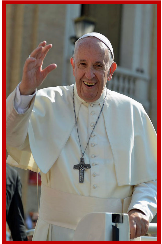
Pope Francis May he rest in peace and rise in glory

Our Mass at St Edmund's will be this weekend's Vigil Mass at 6.00 pm on Saturday evening.