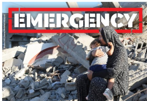
Aaliyah* sits on the remains of a damaged building with her daughter in their neighbourhood in southern Gaza, in October 2024.

CAFOD DEC MEMBER TOGETHER WE'RE STRONGER